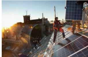
Image copyright: Aleo Solar AG PV installation in Zugspitze, Germany, October 2010 (Aleo Solar)